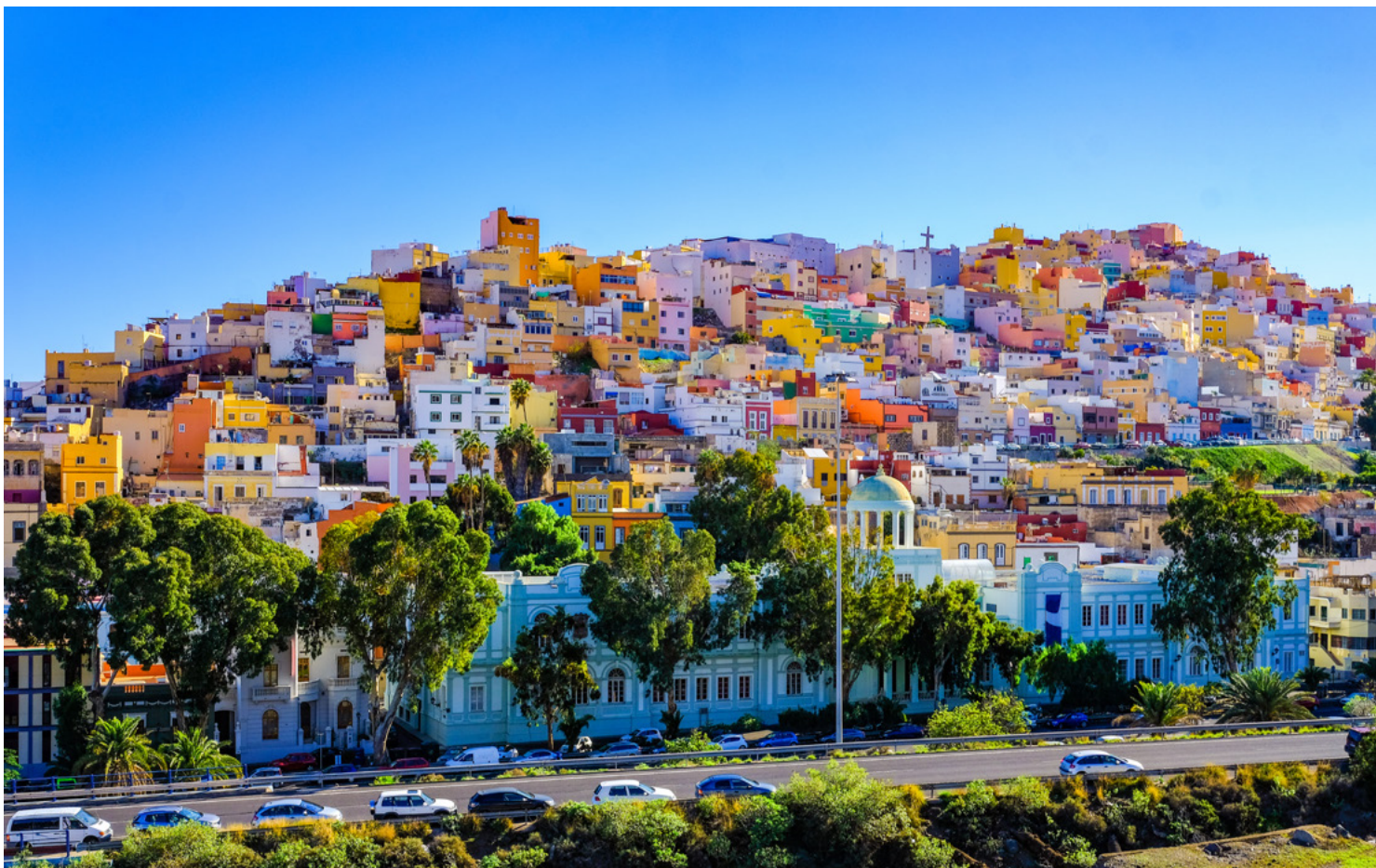
Colorful houses in Ciudad Alta