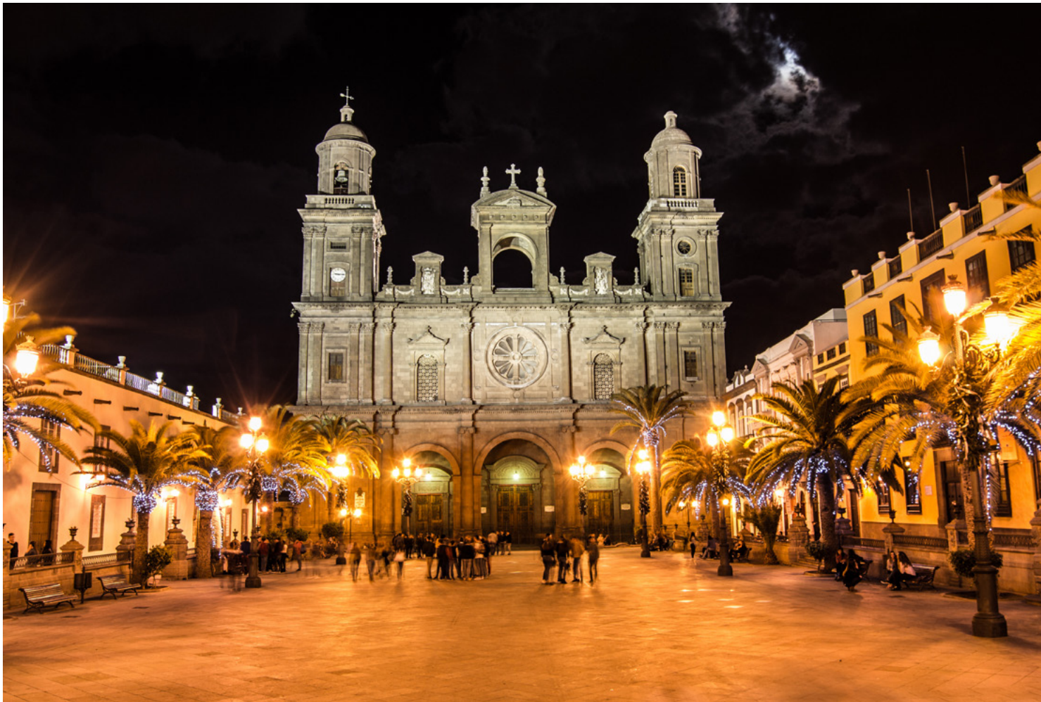
Plaza de Santa Ana