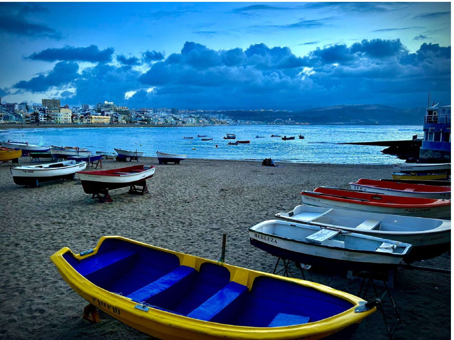
Playa de Las Canteras